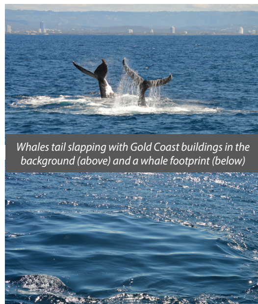
Whales tail slapping with Gold Coast buildings in the background (above) and a whale footprint (below)

Do a google search "where to see whales in SA"